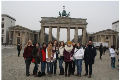
In front of the Brandenburg Gate