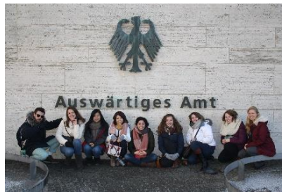
At the Federal Foreign Office