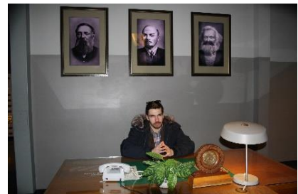
In the GDR museum