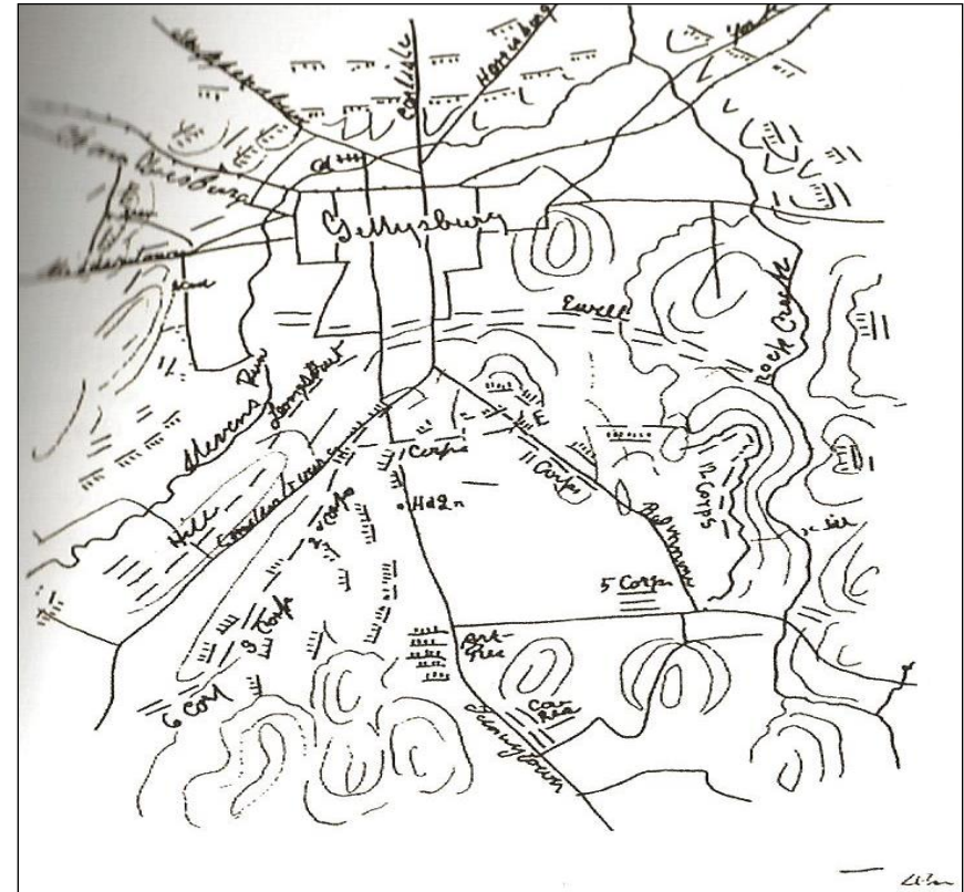
Map of Gettysburg