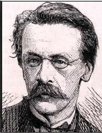
John L. O'Sullivan (1813-1895)