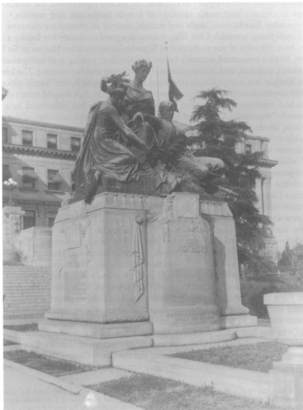
This monument to the women of the Confederacy was erected in front of the state capitol in Jackson, Mississippi, in 1904 by the United Confederate Veterans and the state of Mississippi at the cost of $20,000 and bears the inscription: "To Our Mothers, Our Wives, Our Daughters, Our Sisters."