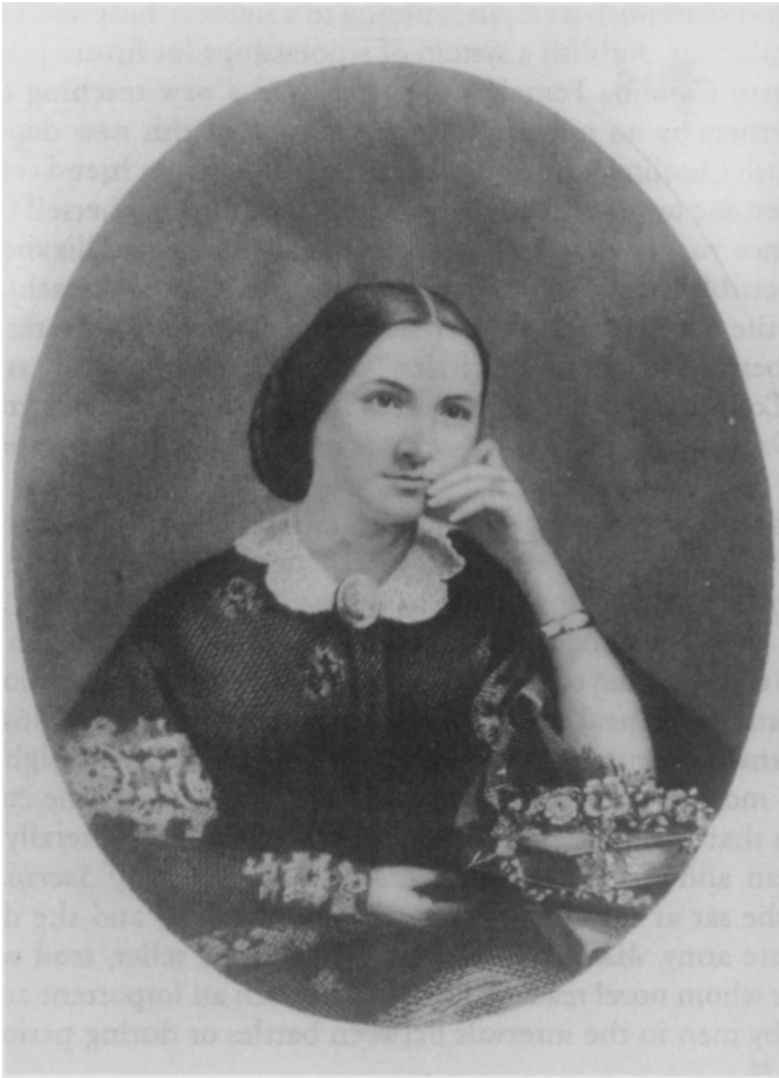
Augusta Jane Evans, author of Macaria; or, Altars of Sacrifice.

giving her father and her beloved beau Russell up to die on the battlefield and dedicating herself to the highest possible existence, laboring in “God’s great vineyard.” Married women, she admits, may be happier, but life was not made for happiness. It is the blessing—and macaria also means blessing in Greek—of the single woman to be more useful “because she belongs exclusively to no one, her heart expands to all her suffering fellow creatures.” For Irene, sacrifice becomes a vocation, not unlike that of the nun. And, indeed, Evans describes Irene abandoning fashionable garments for robes of black or white, tied at the waist by a tassel, suggesting that the analogy with the female religious is entirely self-conscious—for Evans as well as Irene. To her childhood friend, similarly bereaved by war, Irene declares, very much in the language of prevailing Confederate ideology,