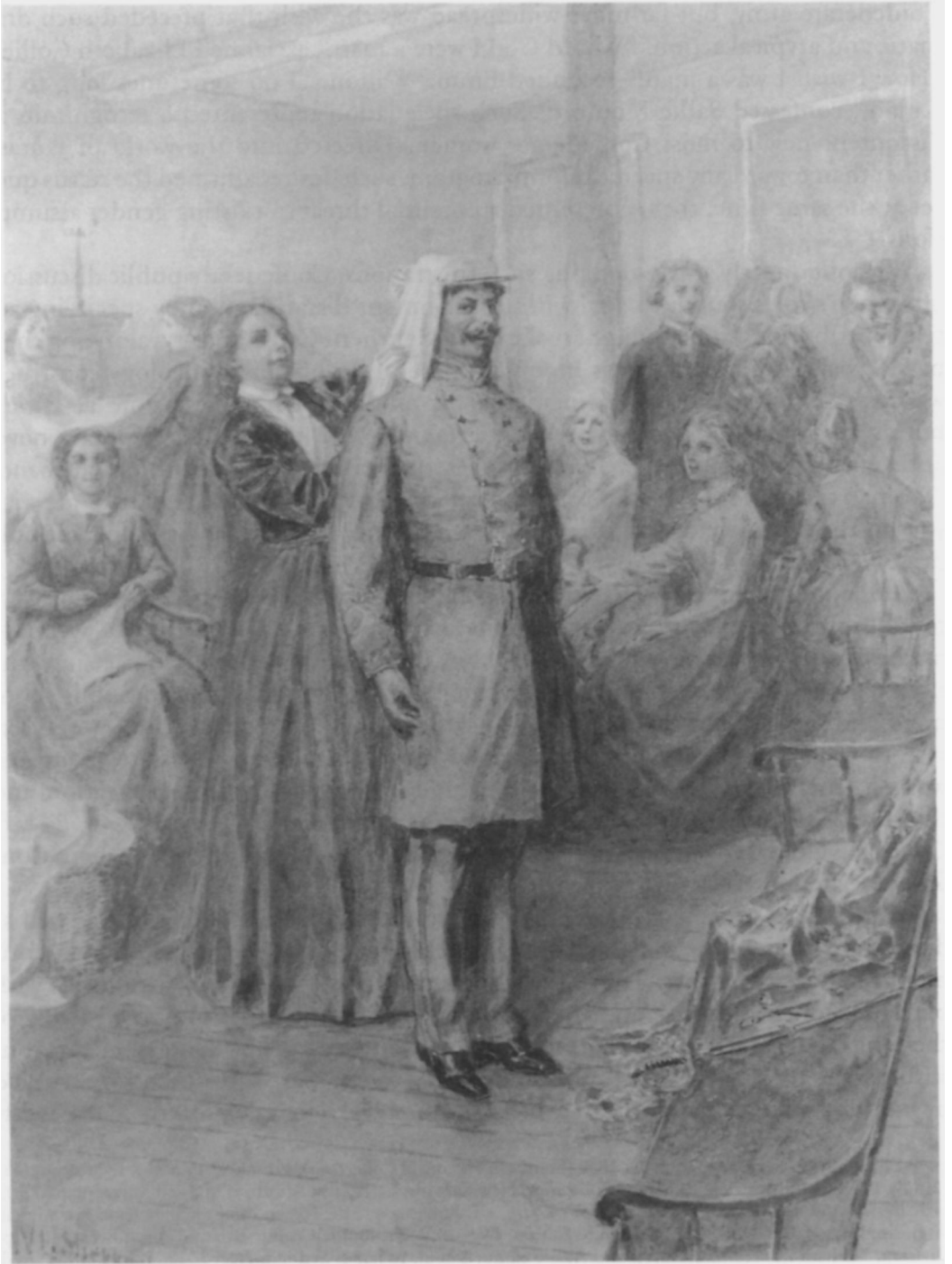
A Southern woman places a havelock—a linen cap popular during the early months of the war—on a Confederate soldier. Watercolor entitled Equipment by Confederate veteran William Ludwell Sheppard.