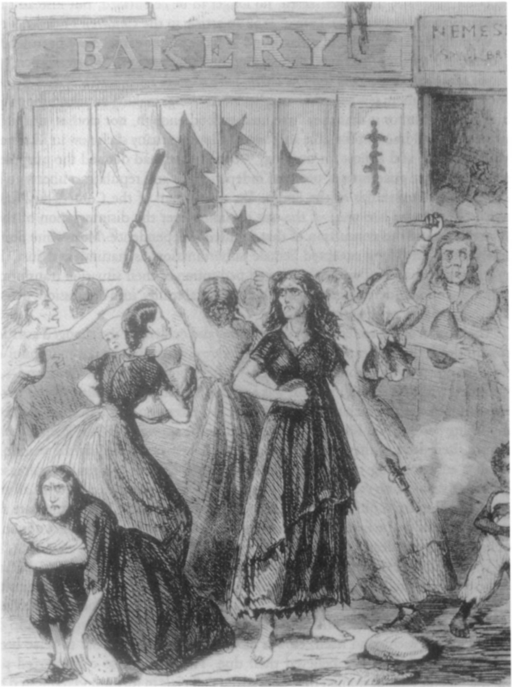
"Southern Women Feeling the Effects of Rebellion and Creating Bread Riots"

— Frank Leslie's Illustrated Newspaper .