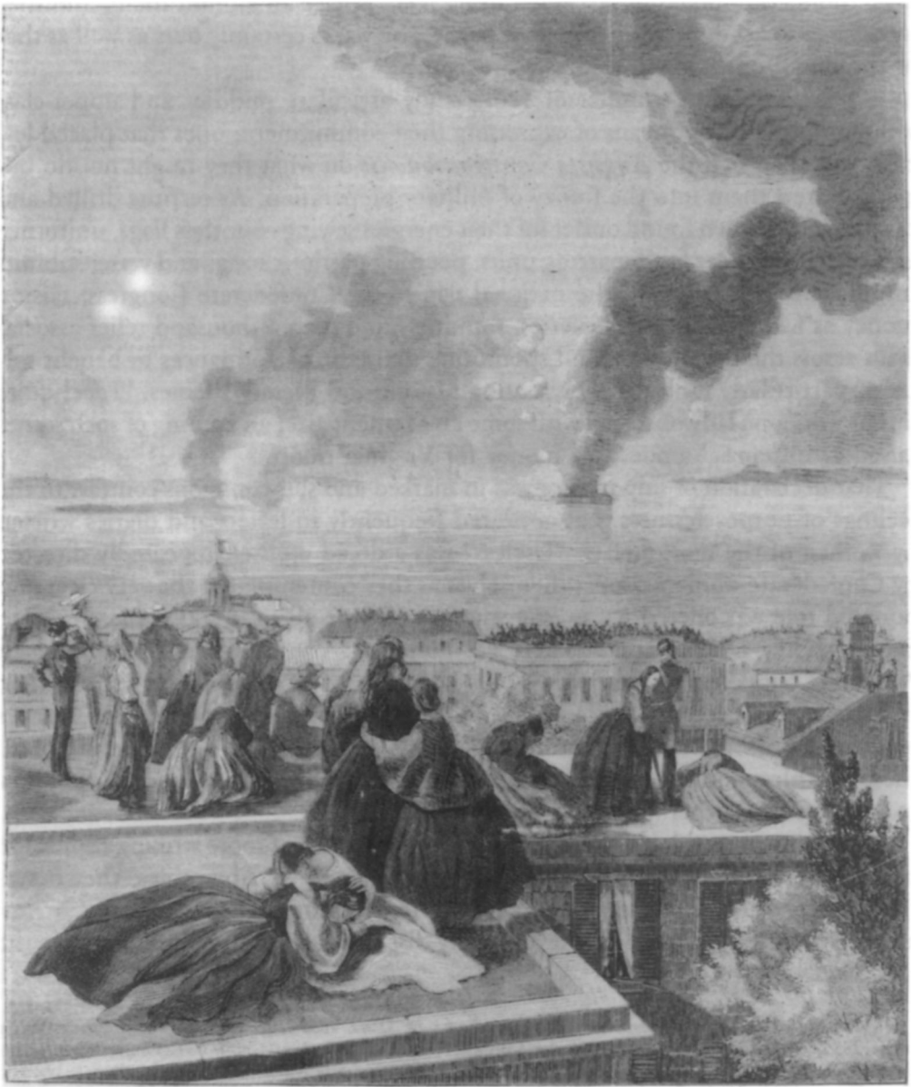
“The House-Tops in Charleston during the Bombardment of Sumter”