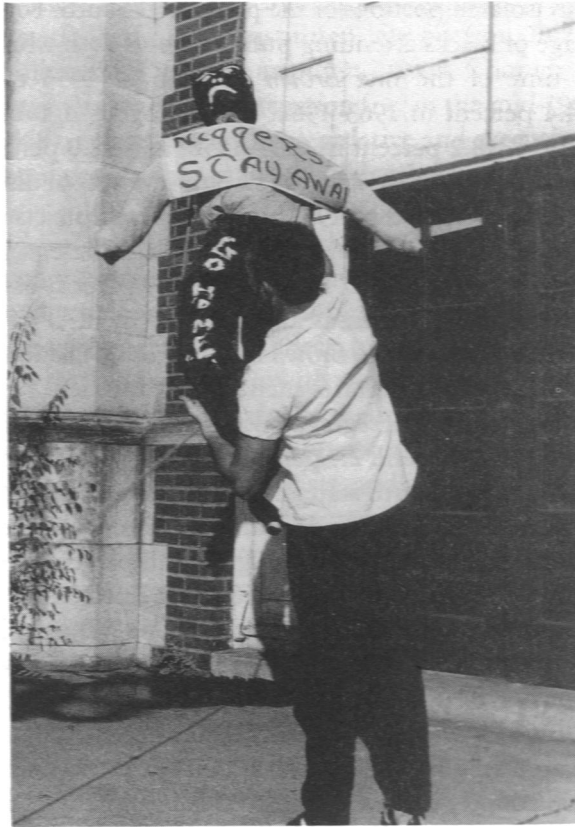
White students protest the Brown decision, which destroyed racial liberalism among southern whites and fomented massive resistance.