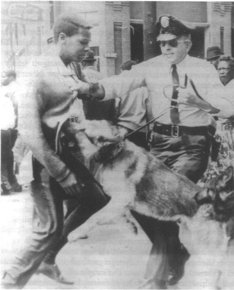
A black civil rights demonstrator is attacked by a police dog during the Birmingham, Alabama, confrontation of April and May 1963. President John F. Kennedy said this photograph made him "sick."

scant resemblance to the landmark legislation that eventually was enacted in the summer of 1964. Only after Birmingham, with the conscience of white America aroused, did Kennedy propose civil rights legislation of a transformative nature, after declaring on national television that civil rights was a "moral issue as old as the scriptures and as clear as the American Constitution." 63