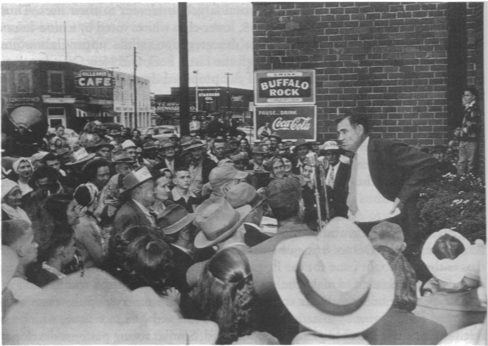
Big Jim Folsom, whose populist brand of racially moderate politics was shattered by the Brown decision, campaigns in Warrior, Alabama, in the Democratic gubernatorial primary of 1954.

lower-class whites who had supported Jim Folsom's populism in the late 1940s and early 1950s tended to support George Wallace, who knew no equal when it came to exploiting the racial hysteria of the post- Brown era. 33