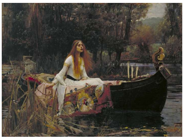
The Lady of Shalott (1888) by John William Waterhouse

This course will examine how monsters, mad scientists, and secret identities rose in the public imagination alongside of a rapidly-changing nation. The nineteenth century saw unprecedented growth of industry and leaps in scientific discovery; new and rapid global communication as well as transport; tenuous relationship of commodities, consumers, and economic stability; as well as changing conceptions of class, gender, and what it meant to be an individual. This course is intended to be an introduction to Victorian literature in a variety of genres, including poetry, the novel, and non-fiction prose.