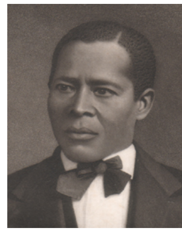
William Still (1821-1902)

The Underground Railroad was a metaphor used by antislavery activists to describe and publicize efforts at helping runaway slaves during the years before the Civil War. While secrecy was essential for particular operations, the movement to help fugitives was no secret at all. Northern Underground Railroad operatives were often openly defiant of federal statutes designed to help recapture runaways. Agents used state personal liberty laws, which aimed to protect free black residents from kidnapping, as a way to justify their fugitive work. Vigilance committees in northern cities such as Philadelphia, New York, Boston and Detroit formed the organized core of this effort. These committees often worked together and provided legal, financial and physical protection to black people threatened