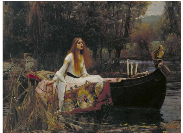
The Lady of Shalott (1888) by John William Waterhouse

NOTE: There is a copy of Writing Analytically on reserve at the library and PDFs on our website. If you chose to use that copy, you must print/photocopy the pages assigned for class so that you can have them with you in class.